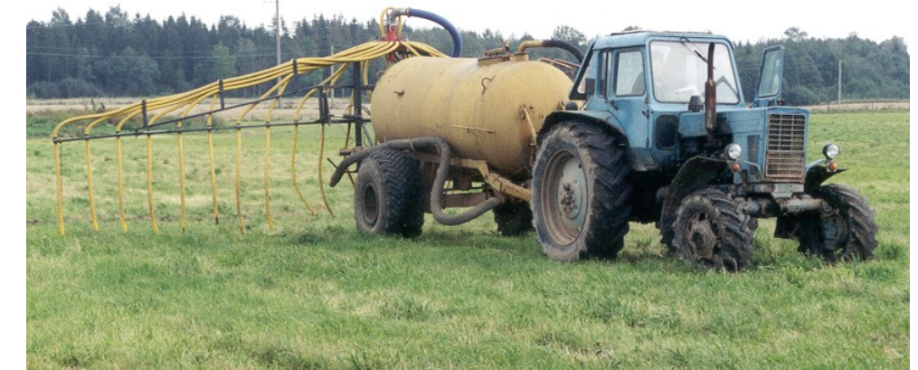
Application of slurry on grass-fields