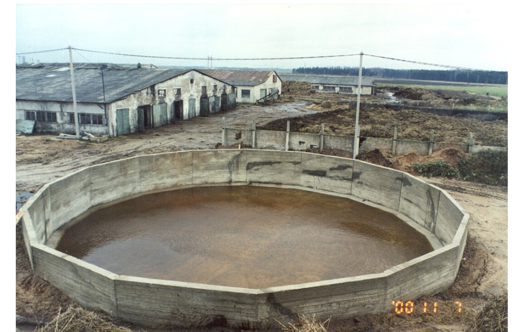
After construction of manure storage and slurry pit